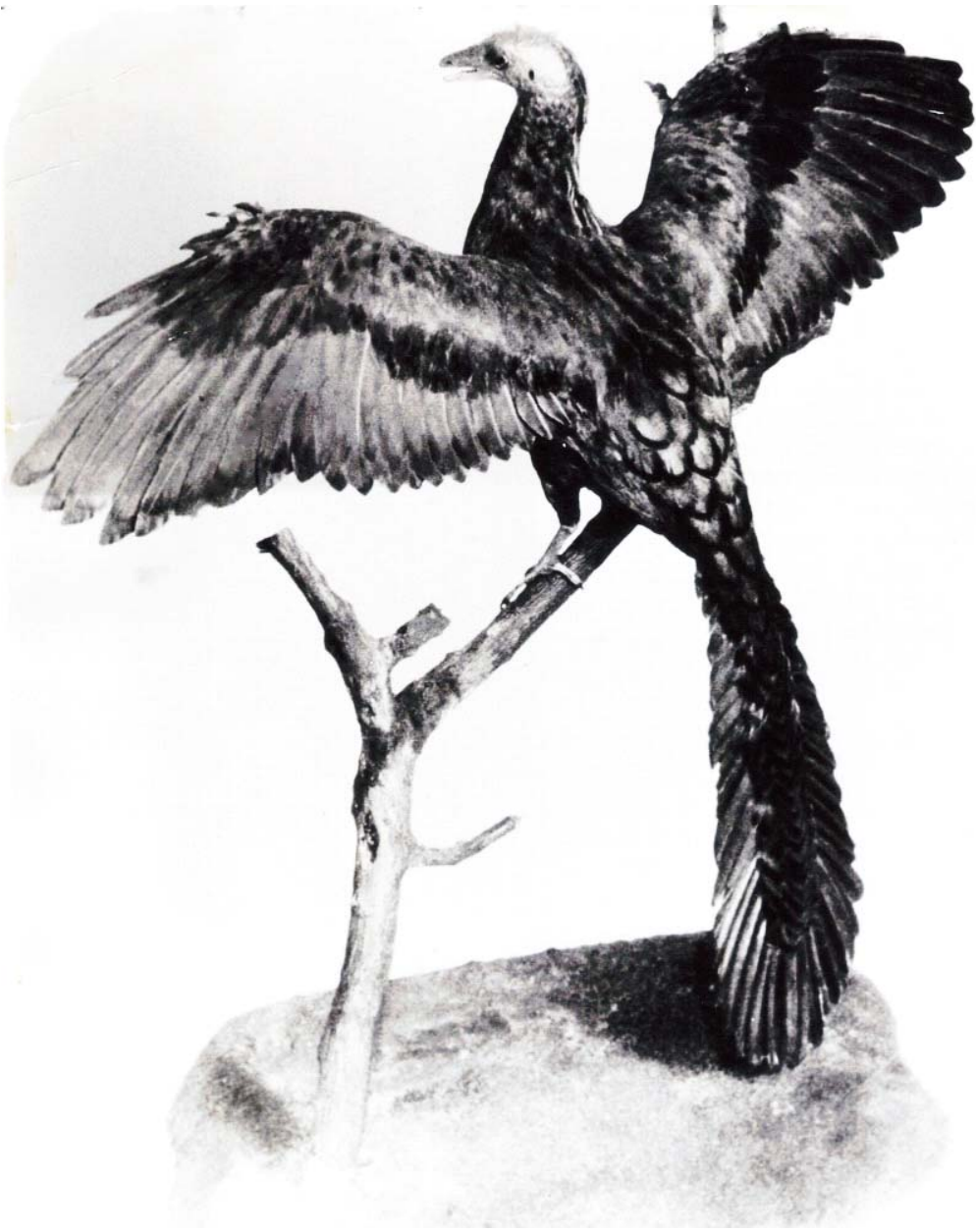
Archaeopteryx -Reconstruction (British Museum), from G. de Beer 1966

Comparison between Archaeopteryx and magpie ( Pica pica ) by O. Heinroth 1938