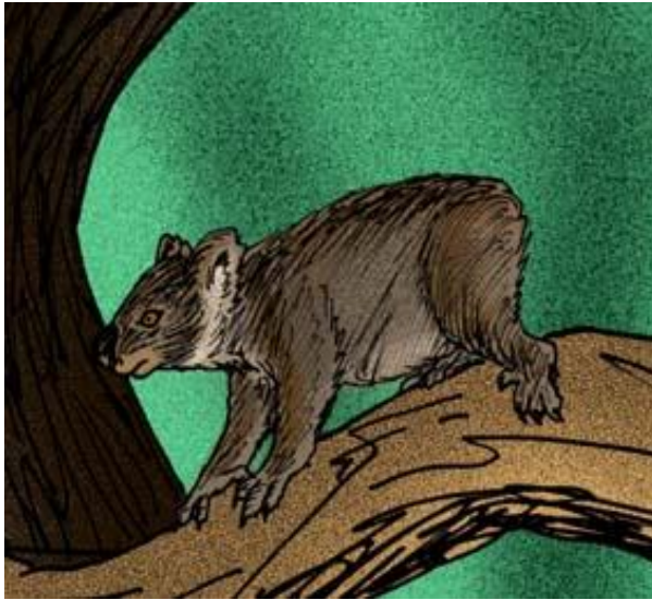
Reconstruction of the extinct koala Litokoala , of the Miocene Riversleigh Fauna https://en.wikipedia.org/wiki/Litokoala#/media/File:Litokoala.JPG

Thus, one of the more ancient koala species displays the most complex molar morphology of all the koalas detected so far 17 . Litokoala is also closely related to the modern koala – its “Age range: base of the Late/Upper Oligocene to the top of the Burdigalian or 28.40000 to 15.97000 Ma.” 18